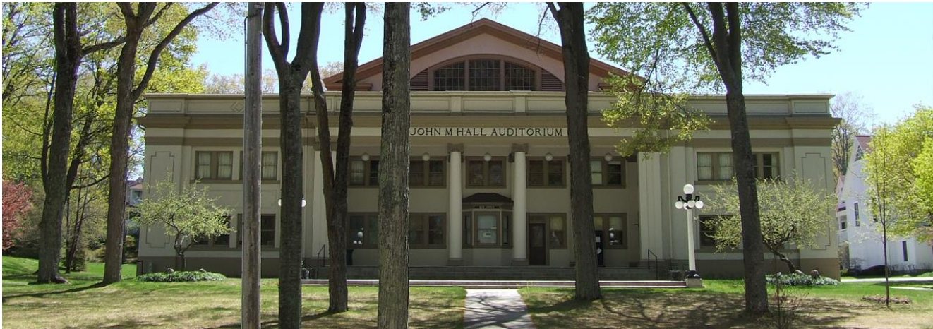
John M Hall Auditorium

The "old sheet barn" as the Old Auditorium was called, where Hemingway, his mother and 2000 others enjoyed concerts by the celebrated mezzo-soprano Madame Schumann-Heink was replaced in 1914 with a concrete concert hall, the John M. Hall Auditorium. Anne Sullivan fell in 1913 taking Helen Keller down to the stage. So, the wooden structure had to go.