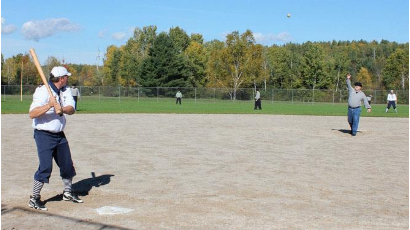
Petoskey Mossbacks vs the Cheboygan Shanty Boys Play Using Vintage 1860's Base Ball Rules

It was a beautiful fall afternoon when the MHS members who had stayed around Sunday afternoon went to a local ball field to watch the Petoskey Mossbacks play the Cheboygan Shanty Boys in a vintage baseball game. What fun! We had hotdogs, chips and pop available as we cheered the teams. They had vintage uniforms, strange rules --no gloves are used, only one baseball is used for the entire game, foul balls are not considered strikes, and you can catch a fly ball on one bounce and it is an out!-- and two teams of volunteers who love the game. The Cheboygan Shanty Boys are in their first season – and they included one woman. The Petoskey Mossbacks, a more seasoned team, won – in an extremely lopsided score. But that was not the primary goal of the game. These people come out on a beautiful day to show the small crowd how the game was played a century ago and how much they love what they do. MHS had about fifteen members and spouses who turned out. I was one of those, and it was GREAT!!!