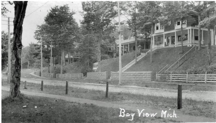
Muddy Woodland Avenue

For Ernest Hemingway, Northern Michigan was anything but black and white. Yet, the Bay View pictures from his time are all black and white. It is as if the Bay View grounds were drab and gray in those days.